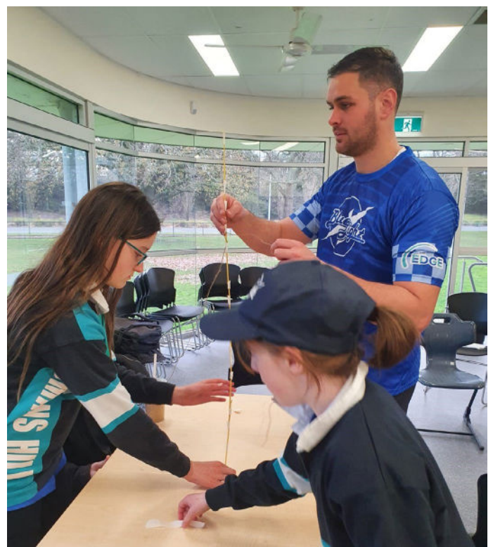
Blue EDGE Woodmans Hill