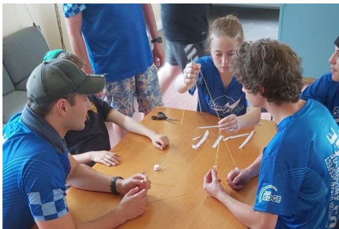
Blue EDGE Orbest