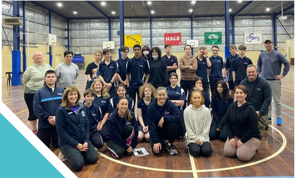
Blue EDGE Cranbourne