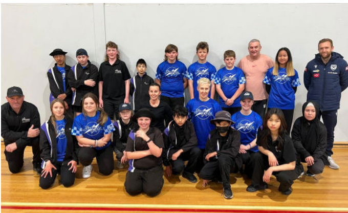
Blue EDGE Corio

Lastly, the highlight of the first 4 weeks was the Police Session! The groups absolutely love hearing about the role the police members have within the community (and seeing the cool equipment and cars they have!) As always, we're so grateful for the support Victoria Police give the Blue EDGE program - thank you!