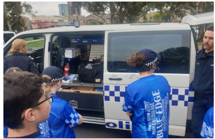
Blue EDGE Coburg