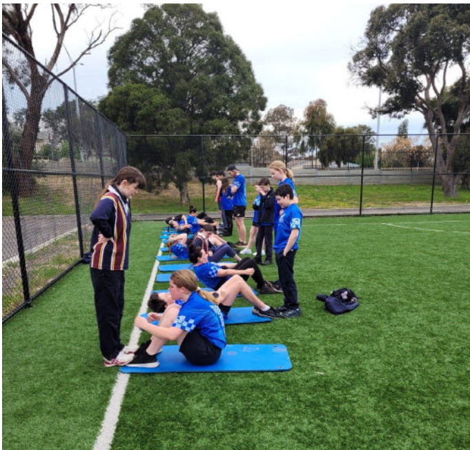
Blue EDGE Bendigo