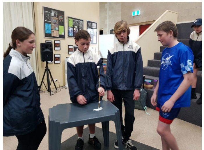
Blue EDGE Portland