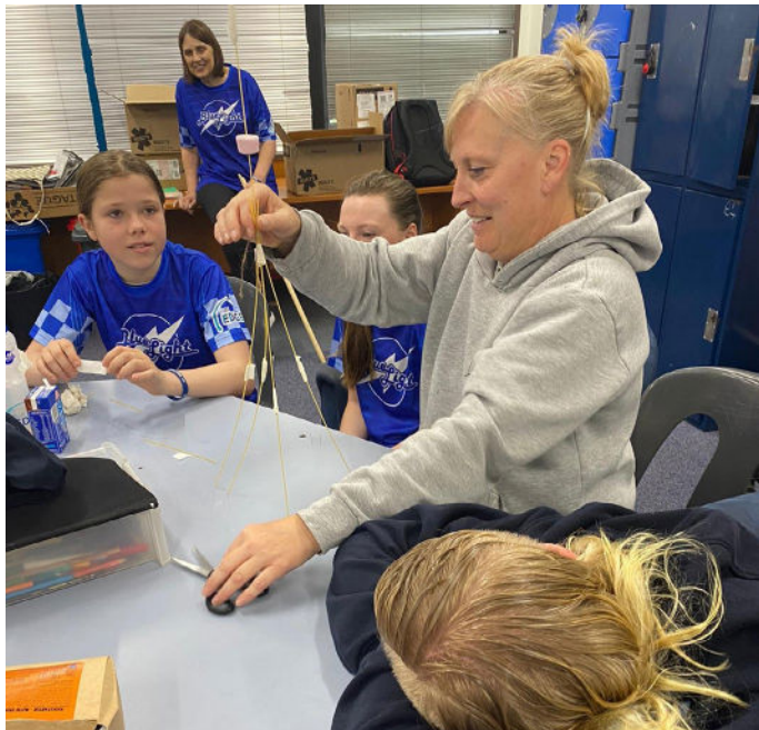
Blue EDGE Churchill

The Spaghetti Marshmallow Challenge was a success! The activity sparked lots of ideas for our Team Agreement.