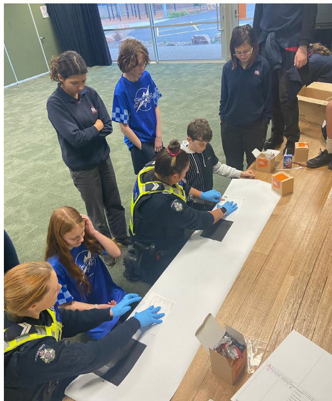
Blue EDGE San Remo