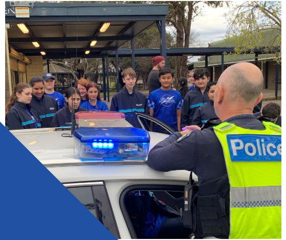
Blue EDGE Cranbourne

Thank you to all involved for organising and the ongoing work you do!