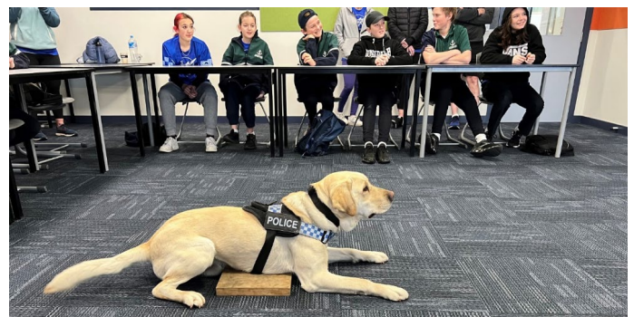
Blue EDGE Newcomb

Next bulletin will feature the Longest Day, an activity everyone is excited about!