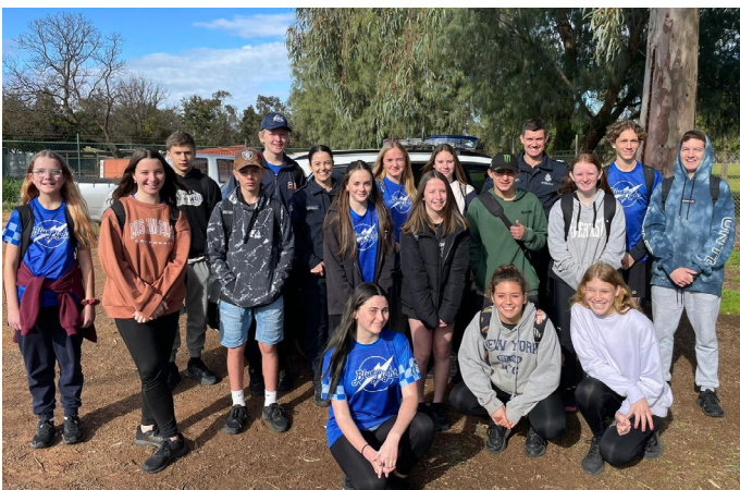
Blue EDGE Red Cliffs