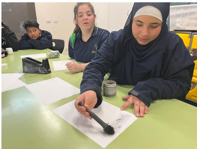
Blue EDGE Broadmeadows