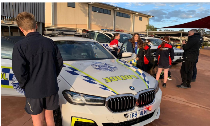
Blue EDGE Maryborough

Eyewatch - Casey Police Service Area August 11 at 10:00 AM