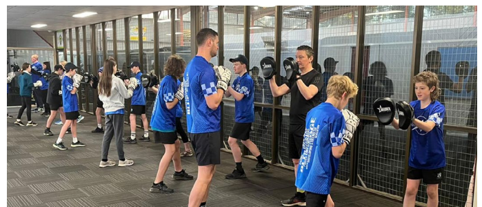
Blue EDGE Woodmans Hill