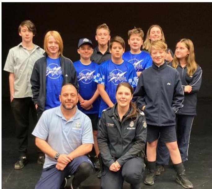
Blue EDGE Frankston