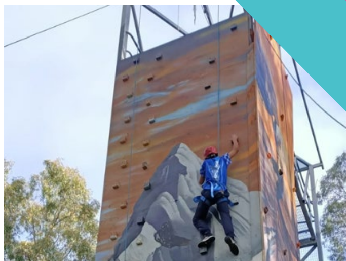
Blue EDGE Bendigo

The fun facts I learn from the students! Some are interested in things I've never heard of or googled in my life - for example, did you know that one of the oldest trees in the world was in Tasmania!