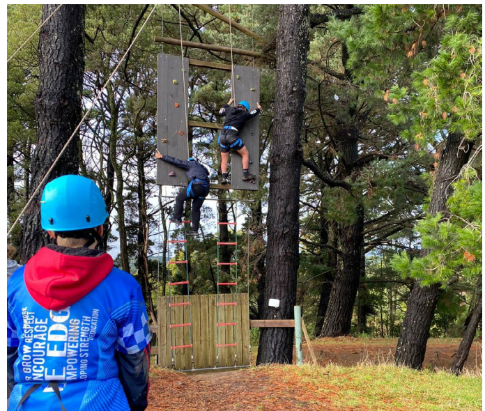
Blue EDGE Wonthaggi