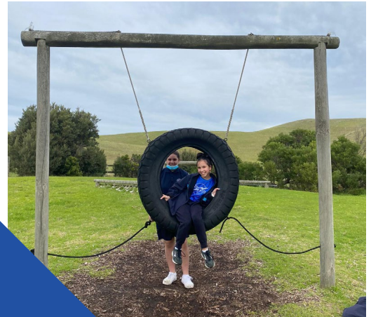
Blue EDGE Cranbourne

A super fun (and educational) session of Blue EDGE - thank you Victoria Police!