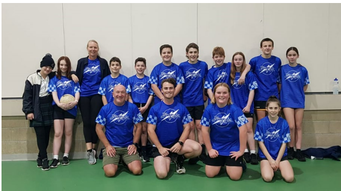
Blue EDGE Portland