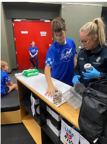
Blue EDGE Frankston