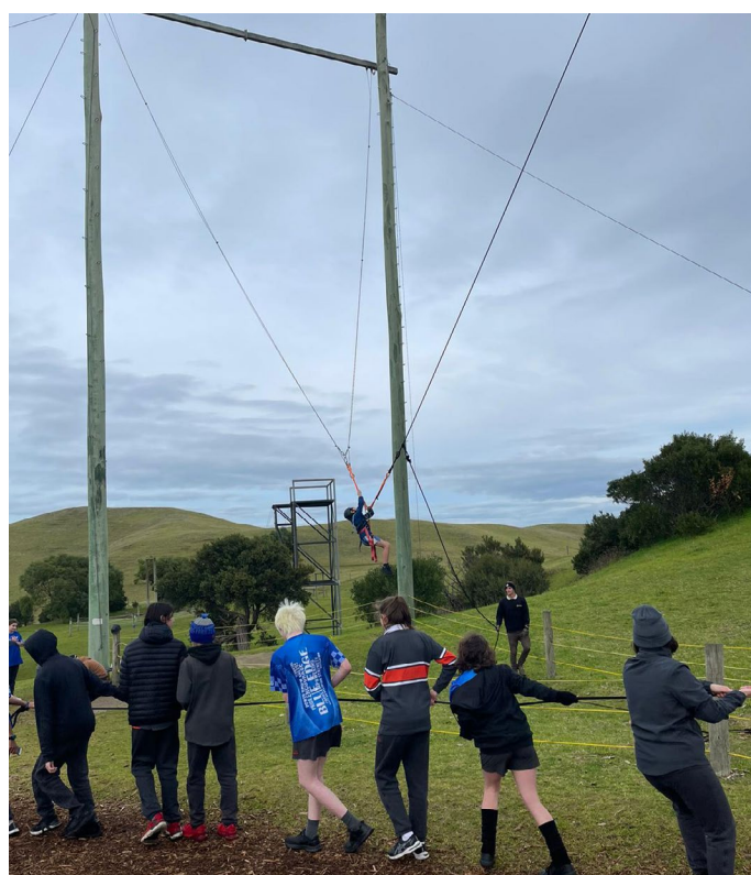
Blue EDGE Richmond

Languages. I'd love to speak every language in the world. Connection is so important - plus travelling would be a whole lot more interesting!