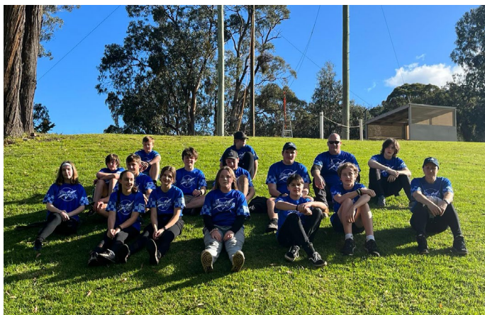
Blue EDGE Bairnsdale