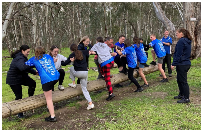
Blue EDGE Shepparton