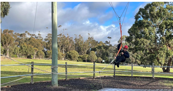
Blue EDGE Broadmeadows

Highlights include: the Dog Squad visiting Broadmeadows, vast improvements all round on the fitness testing, quieter students gaining confidence and finding their voice, the Morwell group getting a taste of the speed gun, an improved attendance record at Bendigo, the teamwork and sense of community that has been created with the police members and of course the Longest Day activities!